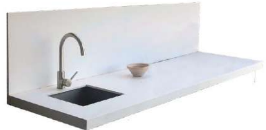
Extra: Barbecue design