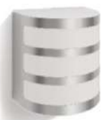
Philips Calgary 4000K