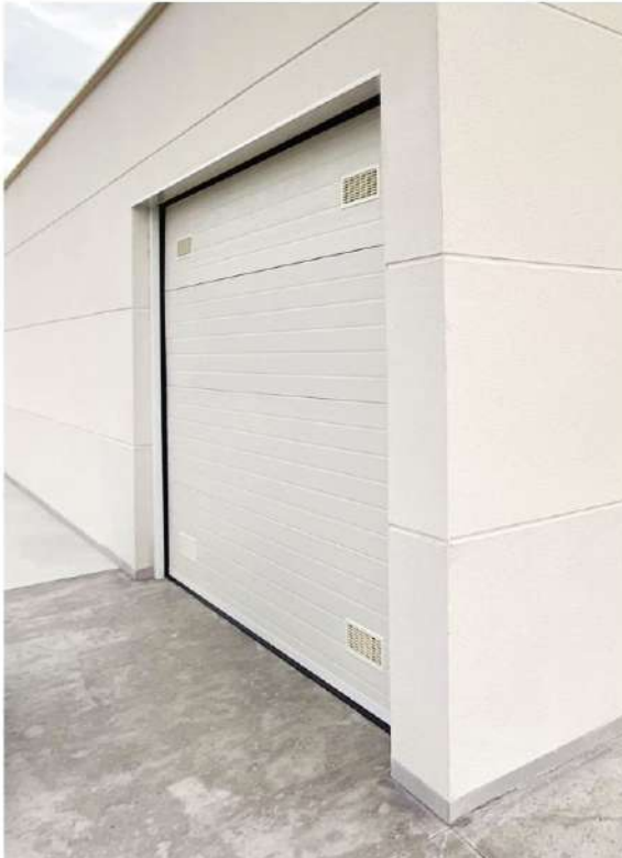
Motorised sectional door