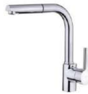
Teka high removable tap ARK 938