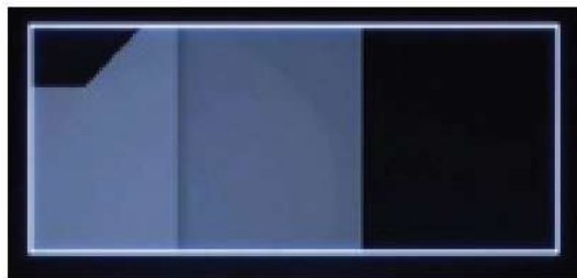
Torvisco Sense 4