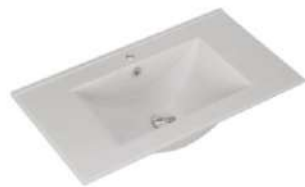
Torvisco Moonstone and Torvisco Cube or similasteel finish