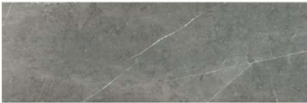
Altamura Wall gray