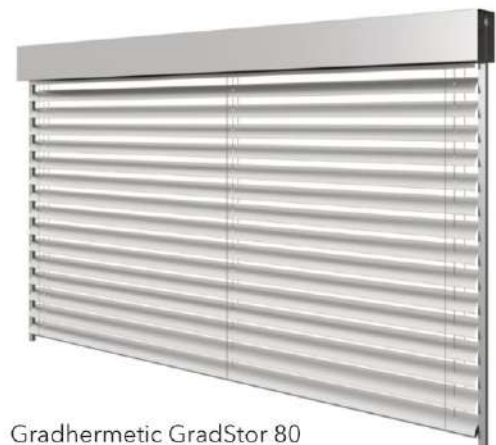
Gradhermetic GradStor 80

If any of the items described above are not available a new item would be agreed between the purchaser and the vendor