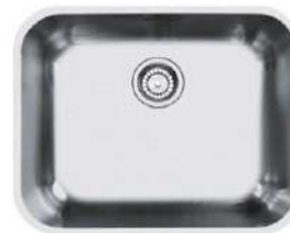
Mepamsa Stilo 40.50 Plus