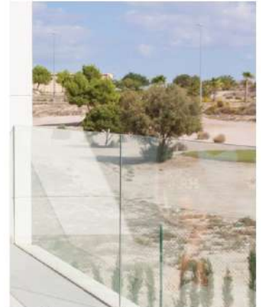
PVB laminated glass 10.10/0,76mm