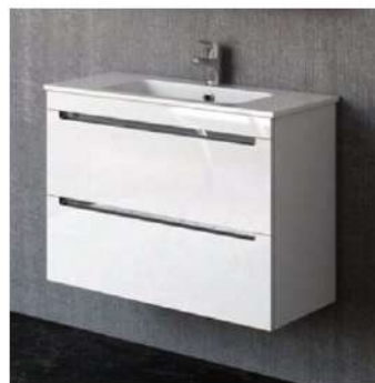
Torvisco Taiga modelo