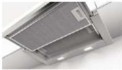
BOSCH DFS067A50, Series 4