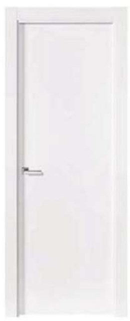
Castalla brand Murillo