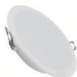
LED PHILIPS Slim Ledinaire 11W DN065B