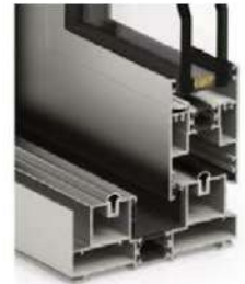
Cortizo Cor 4700