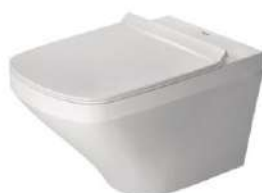
Suspended Duravit Durastyle lavatory