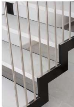
Steps on metal staircase leading to the first floor with the same tiles as the floor indoors.